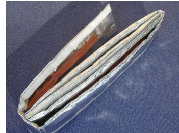
Version with holder bracket for heater