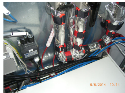
Insulation for an analysis cabinet up to 180°C