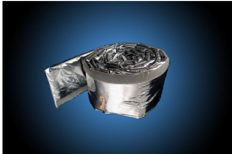
Integrated Velcro only by order